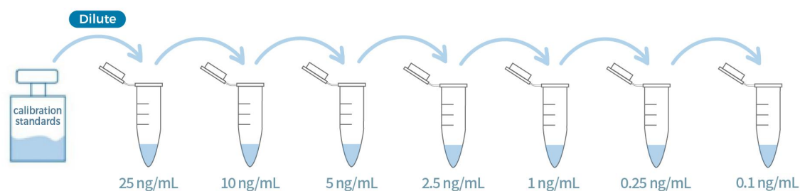
Figure 2. Graphic scheme of SMNE Calibration standard solutions